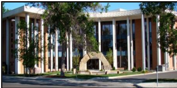
Great Falls Public Library

We are always looking for creative fund raisers and interesting projects to support the library.